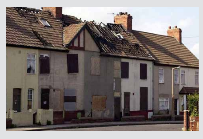
Thompson Avenue and Dixon Road (2000 and 2022)