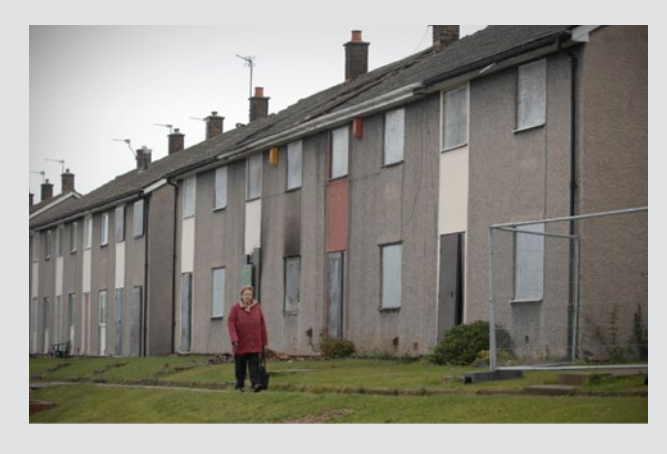
Granby Estate (2008 and 2022)